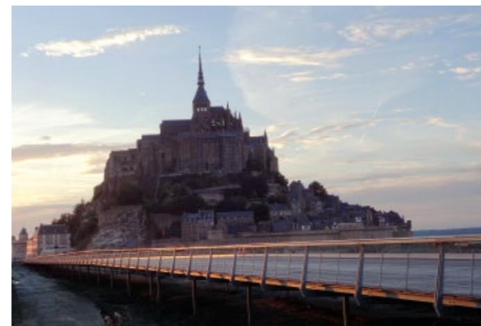
MONT-SAINT-MICHEL PROMENADE © DIETMAR FEICHTINGER

Throughout the experience, travellers will gain exclusive access to non-tourist attractions, such as the Southwick House in England. This is a site where the Allied strategy for the D-Day landings was