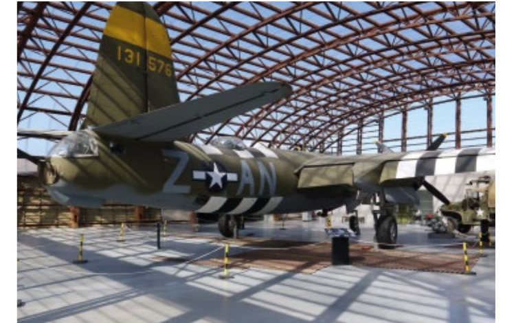
UTAH BEACH MUSEUM