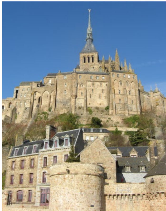
ABBAYE DU MONT-SAINT-MICHEL