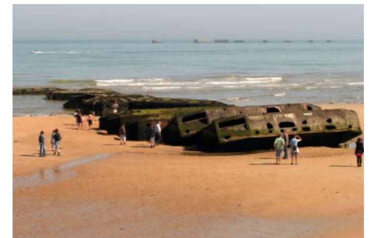
LANDING BEACH