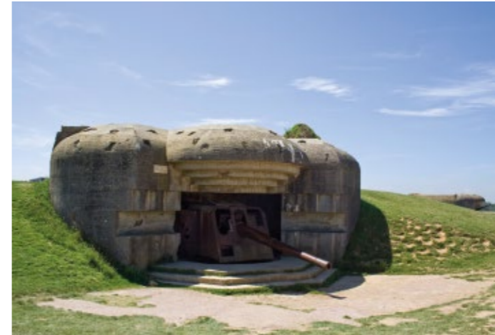
BATTERIE DE LONGUE BY THE SEA © A. SOLTER

Landing on the beaches of Normandy on that fateful day on 1944, the Americans were ultimately victorious, paving the way for the liberation of Europe from the Nazi army.